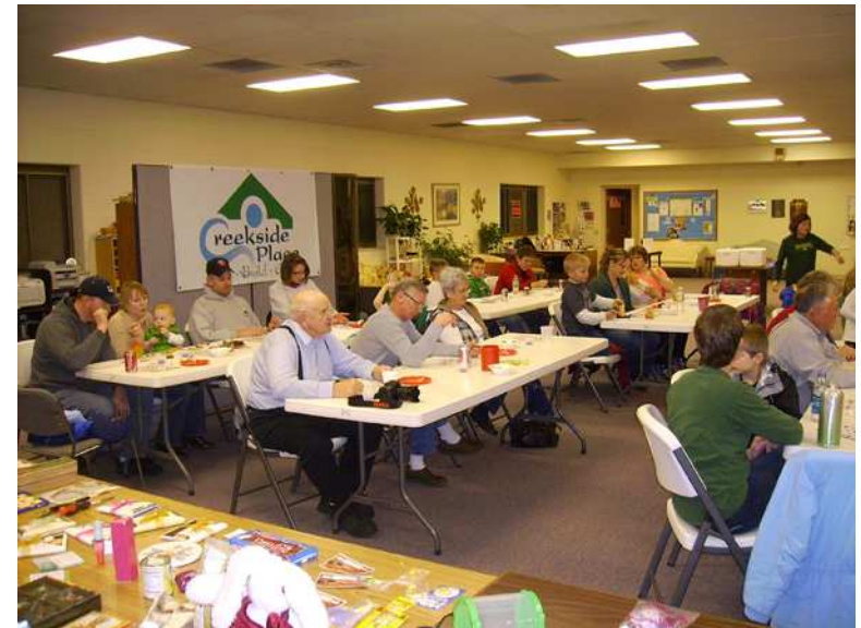
Family Bingo Night at Creekside Place

*Senior Lunch Program Reservations need to be made before 12:00 pm the day before by calling 882-0407.