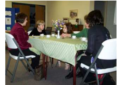
Grandmother-Mother-Granddaughter Tea Party Event